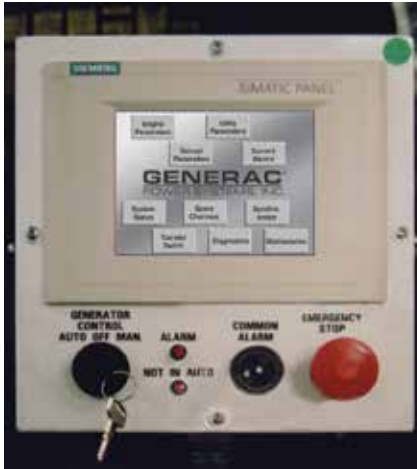
Generac's Digital Control Platform is an advanced control system that exemplifies its engineering innovation.